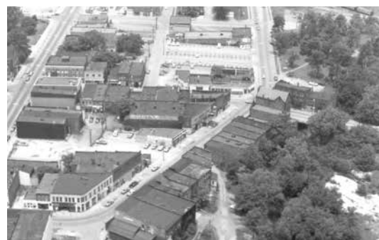
Looking north at Main & State Streets.

So once again we are asking our readers to drop off any pictures that they may have that reflect Niles history. Pictures of buildings, pictures inside the workplace, the street where you live, all are interesting. . With the loss of a daily paper, current events are not being preserved as they once were. The Internet today flashes pictures across our pc's and then it is gone in an instant. The ability to do research years from now will be impossible unless preservation takes place now...Please help... Thank you.