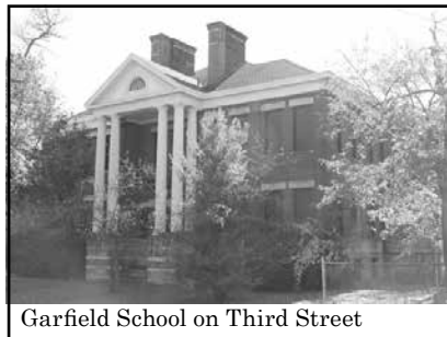
Garfield School on Third Street